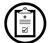
Customs Management Solutions