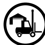
Warehousing & Storage